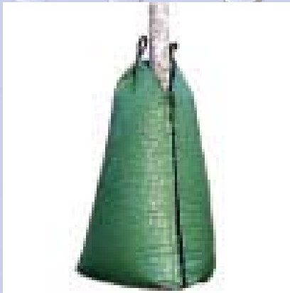
Tree Gator watering bag

The City of Oakdale would like to encourage residents to take an active role in the establishment of their newly planted boulevard tree. Each tree is equipped with a 20 gallon Tree Gator watering bag, a staking system, and a 6' mulch ring. The Tree Gator makes watering a cinch, the staking system aids in support and protection, and the mulch moderates soil temperature and helps retain soil moisture. To take a stewardship role in the establishment of your boulevard tree all you need to do is follow the watering instructions! Adopting the watering schedule of a boulevard tree allows you to take control of the most critical factor in the growth and establishment of your boulevard tree. If you are interested please contact your City Forester at (651) 501-5302.